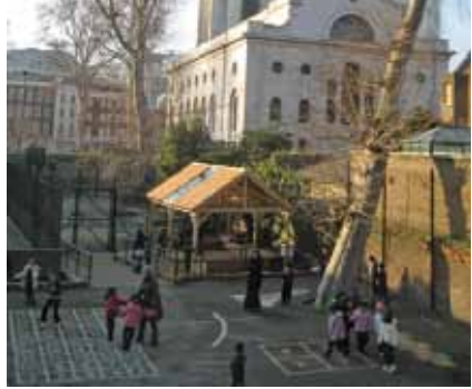
Christ Church School Playground