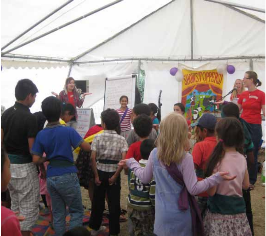
Church and local children singing at the Children's Holiday Club