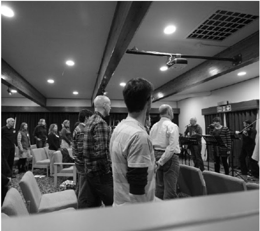
Worship at the church members weekend away