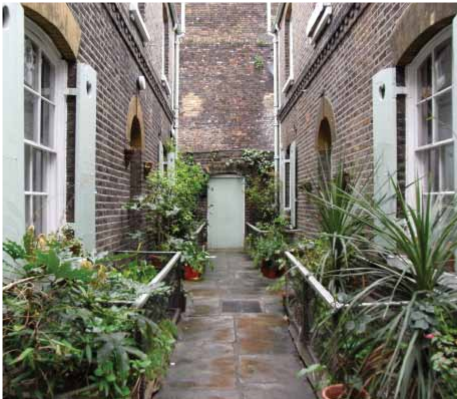
Gardens of Norton Folgate Almshouses