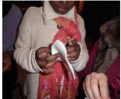
Stitch and Canvas