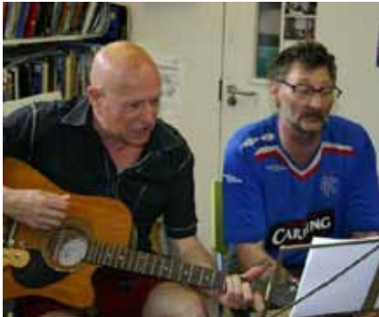
Spitalfields Crypt Trust's New Hanbury Project