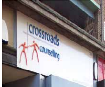
Crossroads Counselling Service