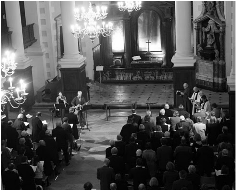
Service to commemorate the restoration of Christ Church