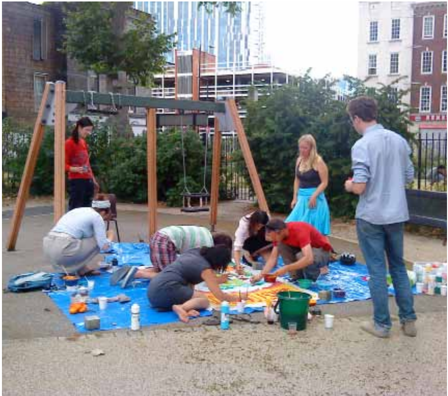
Church members preparation for Christ Church Children's Holiday Club