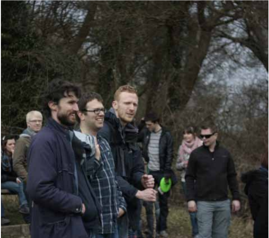
Church members weekend away at Oak Hall Manor