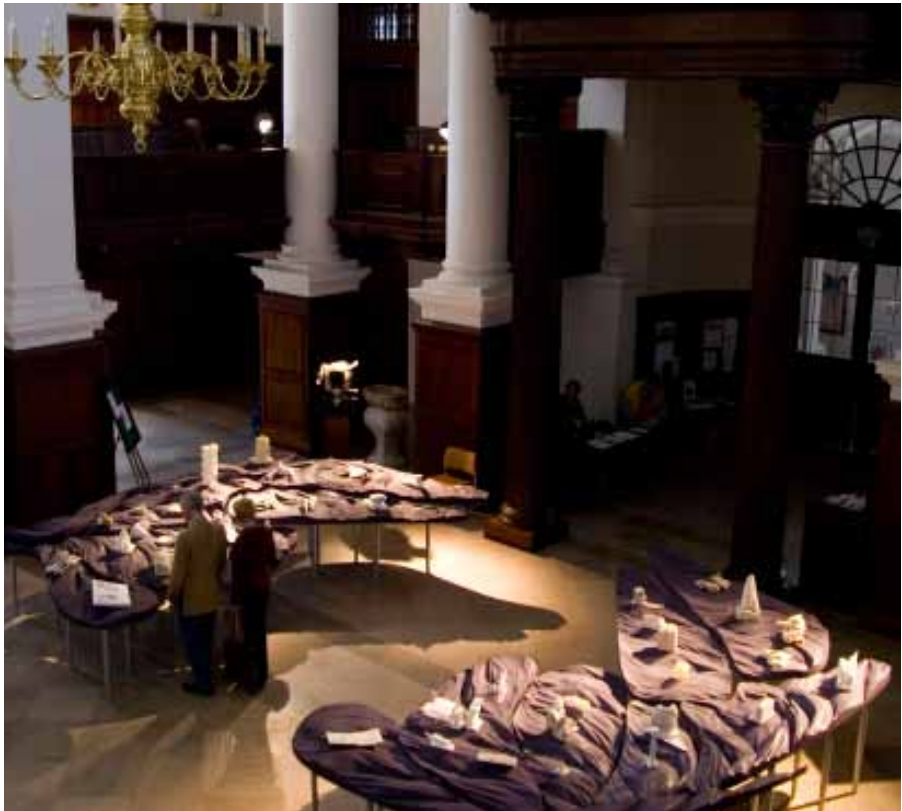
Sublime Flesh , designs for new Sacred Spaces by Bartlett School of Architecture