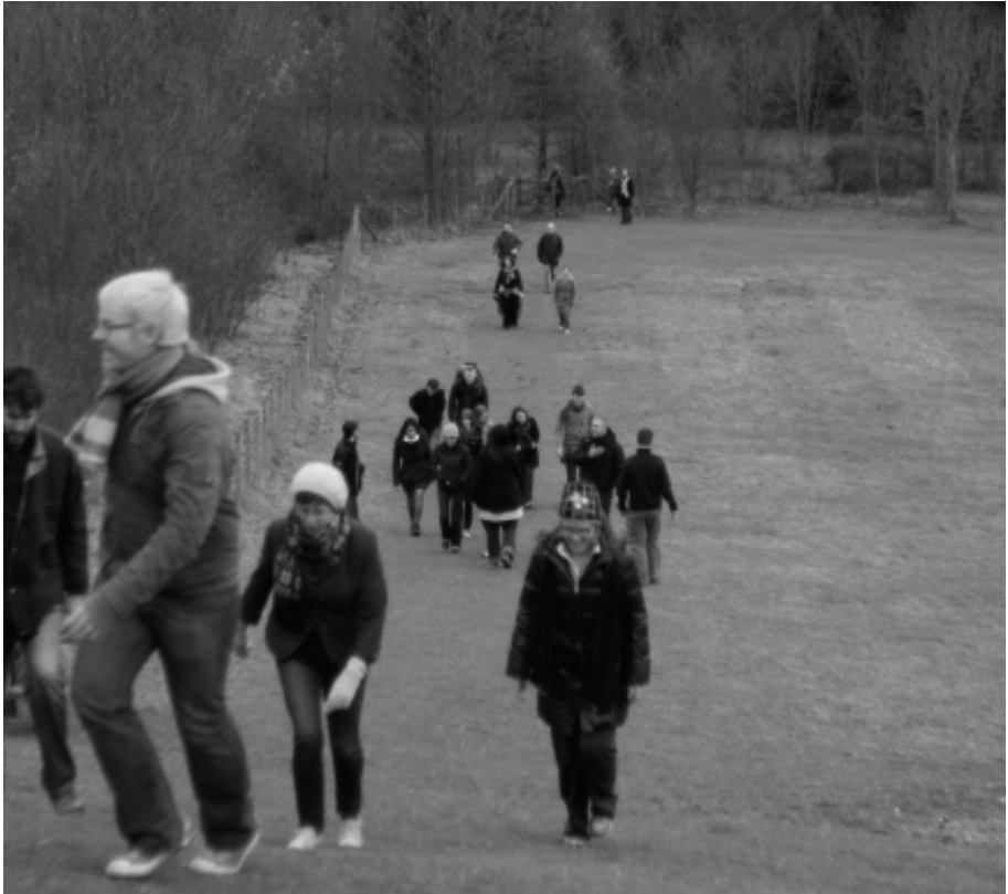
Church members weekend away, Oak Hall Manor