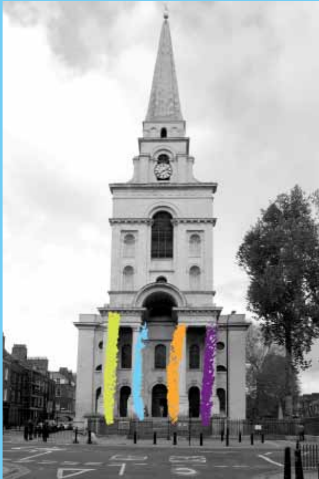
Christ Church logo design by Oliver Smith